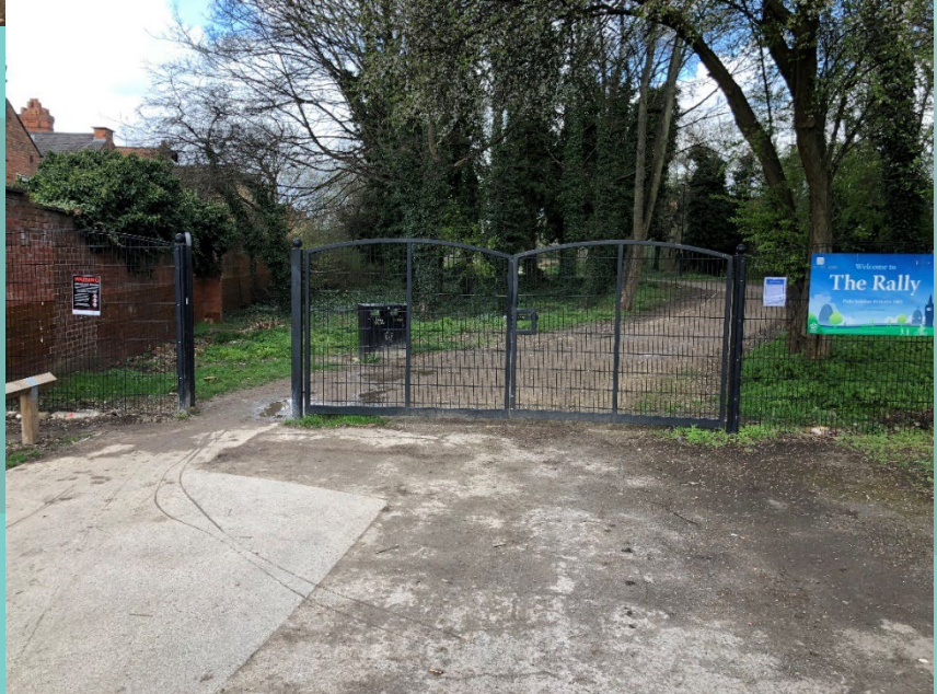
Right: Poor accessibility and visibility at Tudor Road entrance